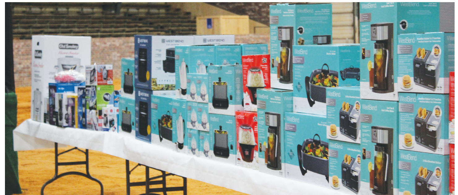
Central Electric provides door prizes for members in attendance.